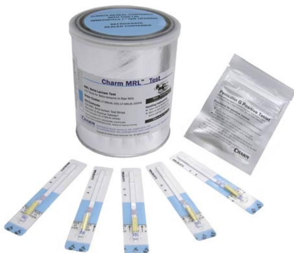
Charm MRL Beta Lactam Test